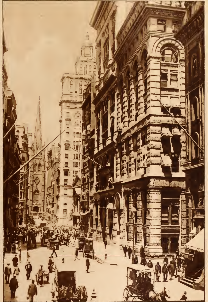
WALL STREET. Foremost financial center of the world, lined with great banking houses. Named from a wall built by Peter Stuyvesant in 1653 to defend New Amsterdam.